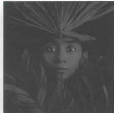
Luis Gonzalez Palma, La Palma , 1994, gelatin silver print with asphaltum 20" x 20"

Native Images is an exhibition of photographs that document the people and practices of cultures native to the Southwest and Central America. The work in this exhibition ranges from the traditional and familiar, such as that by Edward S. Curtis, to examples of lesser known portraitists, such as William Stinson Soule, F.A. Rinehart, and Rose and Hopkins, all of whom photographed the leaders of most of the Native American tribes/cultures in the late 19th century. Selections from Paul Strand's Mexican Portfolio, completed in the early 20th century, will also be on display. Contemporary documents of festivals in Spain by Cristina Garcia Rodero, as well as portraits which combine history and fantasy by Guatemalan Luis Gonzalez Palma will round out the exhibition. This exhibition shows us not only how we see indigenous cultures, but also the various ways we illustrate (or ignore) difference.