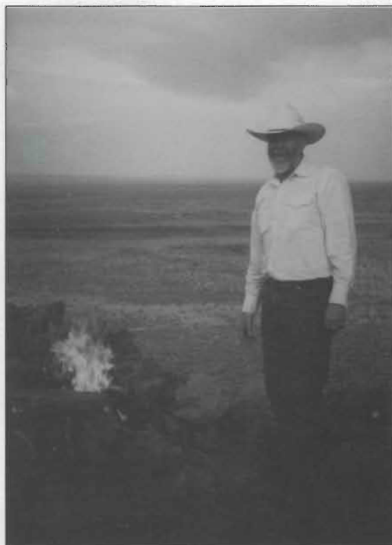
Artist James Turrell at base of Roden Crater, late August 1994

I am always taken with the subtlety of the project and how much it forces me to think about the desert and its past. Jim states it is the kind of place "where you feel geologic time". The site is a place to ponder sky, clouds and space and was a perfect way to escape one's day to day thoughts—a vacation of a different sort.