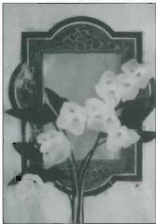
Eclipse , 1994, egg tempera on panel, 22" x 15"

Reading the Night is the premiere exhibition of paintings by Chicago artist Andrew Young at Lisa Sette Gallery. Young uses the technically difficult and art historically laden medium of egg tempera painting and the traditional format of still life composition to imbue his paintings with an intimacy that draws the viewer into a sensual engagement with the paintings. Infused with rich, glowing tonalities and lush, patinaed surfaces, the paintings are a balance of lyrical fancy and static formality. Flower, bird, frame, architectural fragment—all exist as both symbol for and embodiment of beauty and desire within a purely painterly world of illusion.