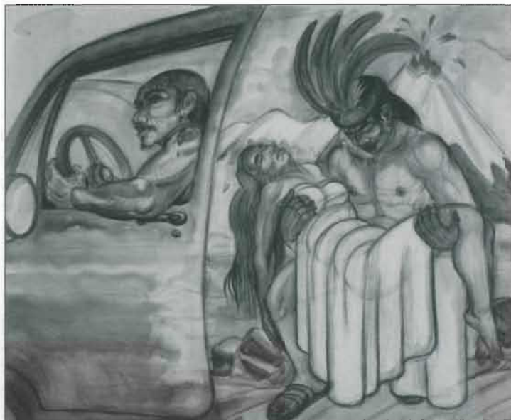
Cholo with Lowrider Van , 1993, watercolor on paper, 43" x 52"